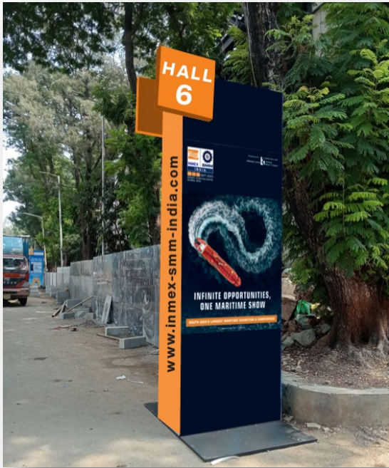
Pylon Cuboid on Pathway