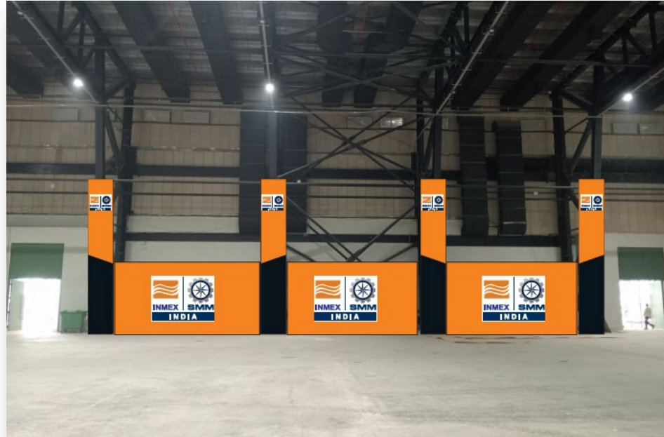
Hoarding between pillars